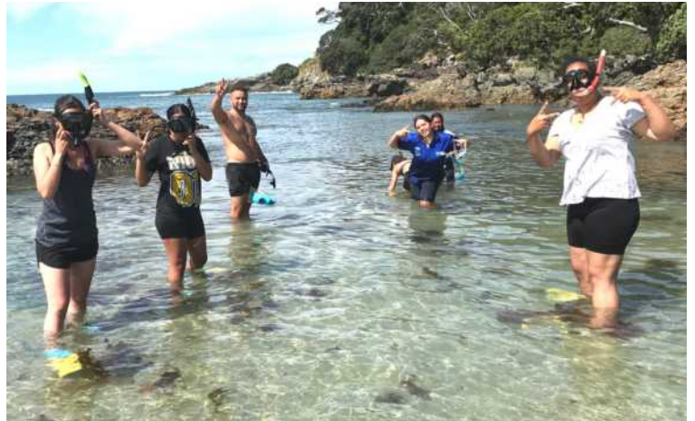
Many of our students experienced snorkelling for the first time.