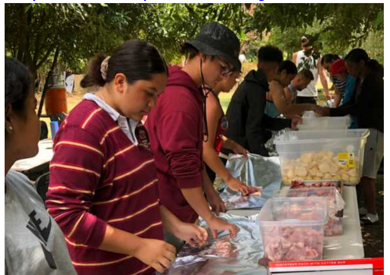
Students enjoyed Hangi preparation and lots of outdoor exercise.