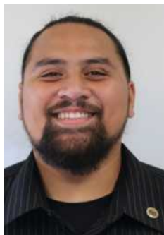
Aviata from TRF Sir Edmund Hillary Collegiate, Otara:

In their own words, my students say that life hasn't changed too much because "they've always been in lockdown". Poverty has always meant a lack of options, no money to go out, nowhere safe to go out to.