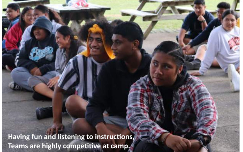
Having fun and listening to instructions, Teams are highly competitive at camp.