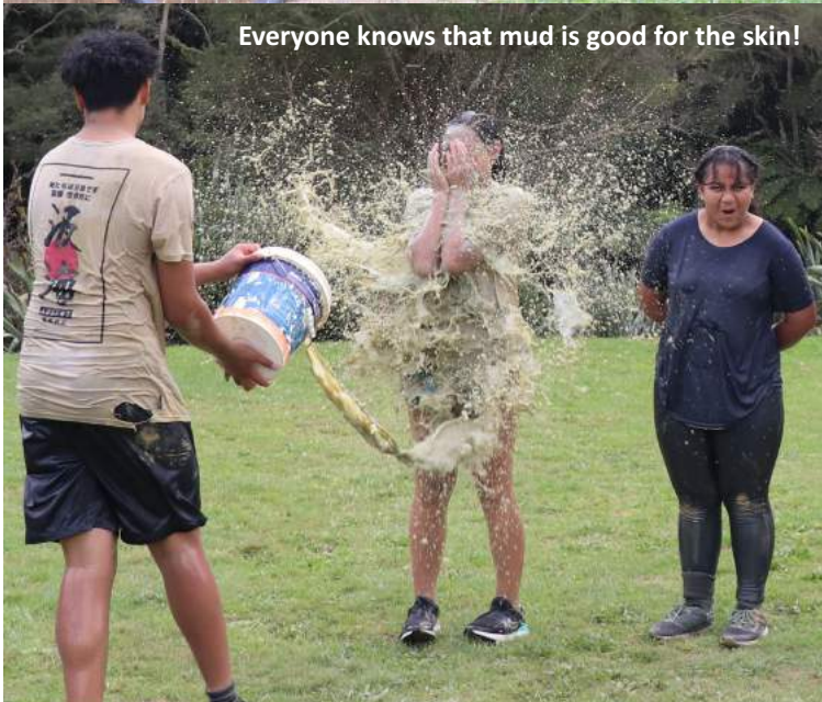
Everyone knows that mud is good for the skin!