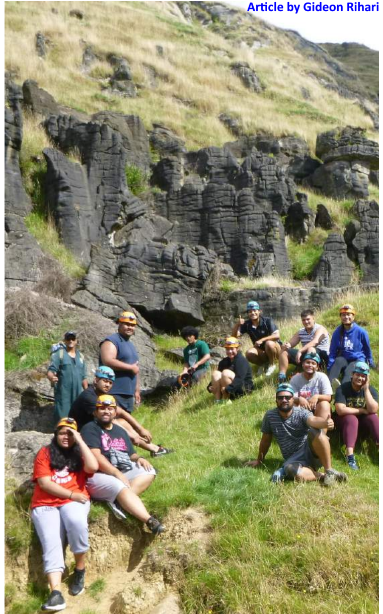
Just before descending into the caves with the Raglan Rock team and (Below) Exercising our artistic abilities and mimicking nature.

The desired outcome of Summer R&R is that student's feel, cool, calm and collected as they step into the New Year. They have spent quality time in open discussion, reflecting and re-evaluating their direction. They have set new personal goals for themselves and they have been inspired with the vision their Coordinators have for their group. They then take this vision back to school with them and help bring it to life.