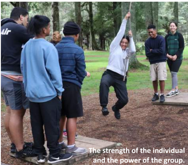
The strength of the individual and the power of the group.