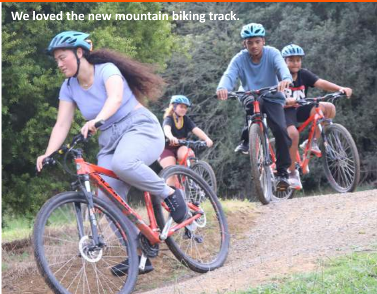
We loved the new mountain biking track.

The positive physical, mental and emotional breakthroughs experienced by our students have continued to echo into Term 2. Real camp has proven to be the best kick-start to the year for our TRF school groups and was a very positive lead up to our next theme for Term 2: Vision .