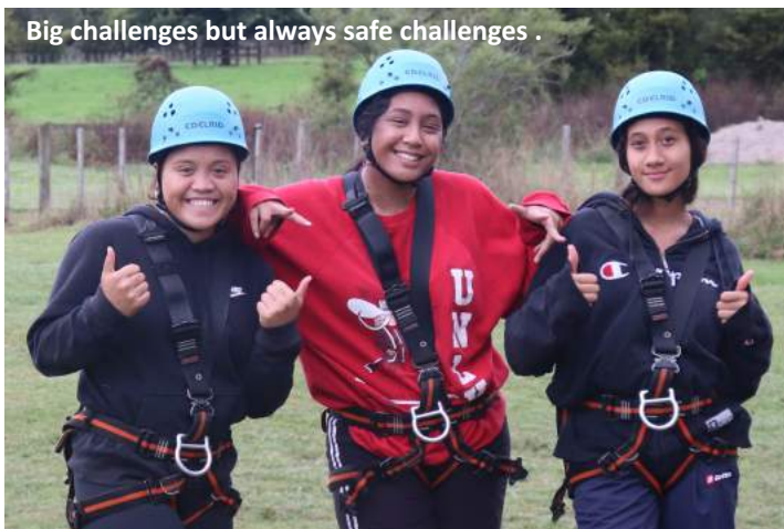
Big challenges but always safe challenges .