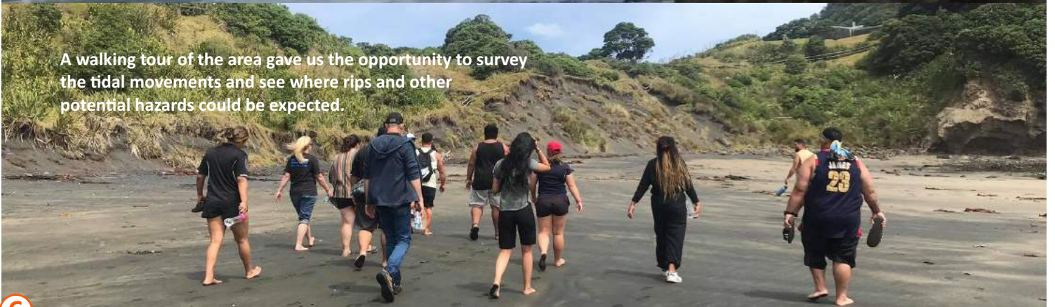
A walking tour of the area gave us the opportunity to survey the tidal movements and see where rips and other potential hazards could be expected.