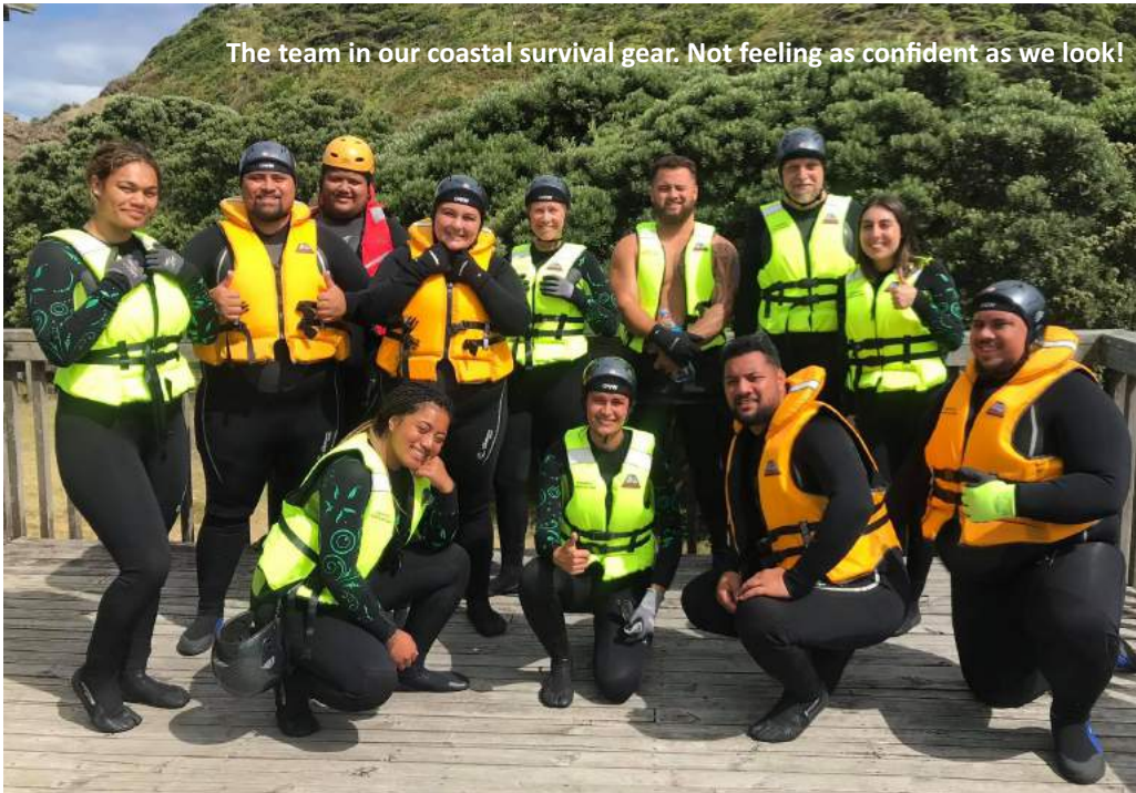
The team in our coastal survival gear. Not feeling as confident as we look!

Away from the relative safety of the pool we were introduced to the power and unpredictability of the ocean surf environment - first between the flags at Bethel's Beach and then we were taken to a tidal gully called 'The Gut' a channel of rough rocks and strong surging waves.