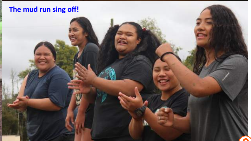
The mud run sing off!