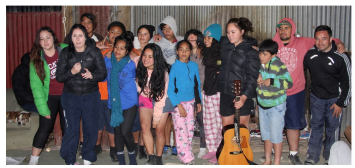
Camp winners—Group A