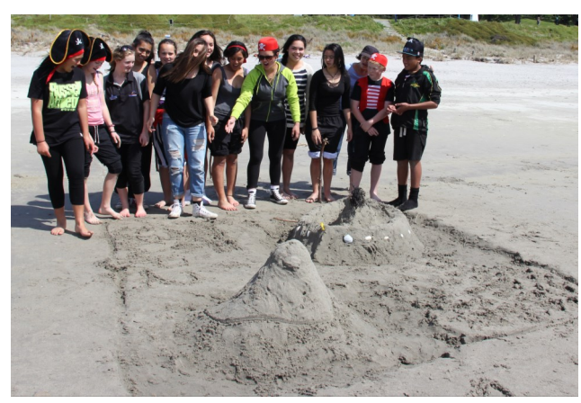
Group 2—winners of the sandcastle competition along Mt. Maunganui`s precious beach...