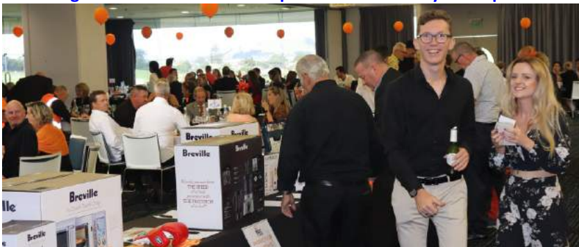
Congratulations to all our silent auction winners.