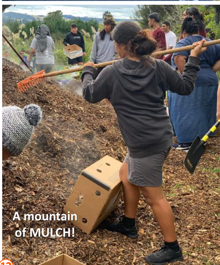
A mountain of MULCH!

The Rising Foundation was fortunate enough to be hosted by the Blue Light Lodge in Wairakei, Taupo. We took students from Papakura High School, Manurewa High School, and Sir Edmund Hillary Collegiate in Otara.