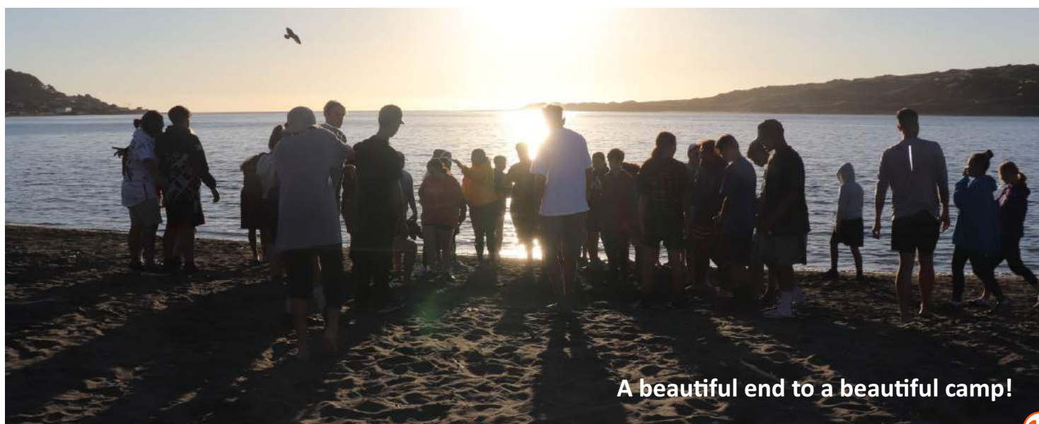
A beautiful end to a beautiful camp!