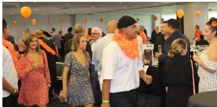
As our guests arrived, the sense of excitement and celebration grew.