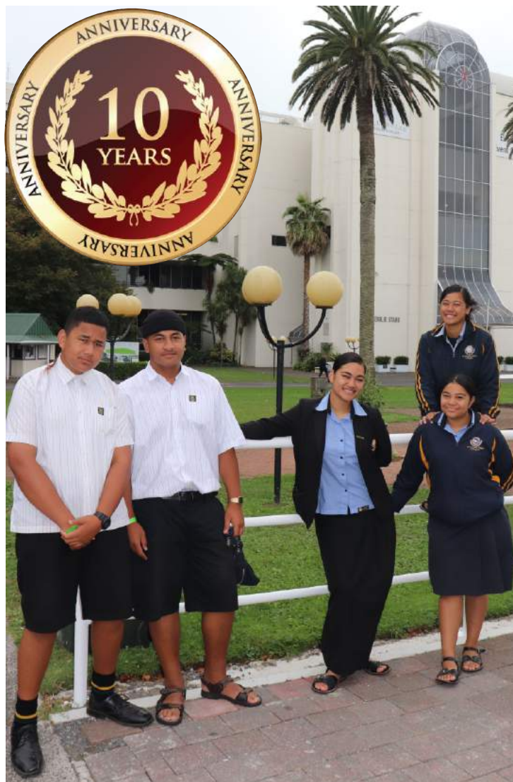
Our great student volunteers outside the Ellerslie Event Centre