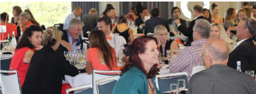
This was a great opportunity to enjoy a great day out, meet new people and help a worthy cause.