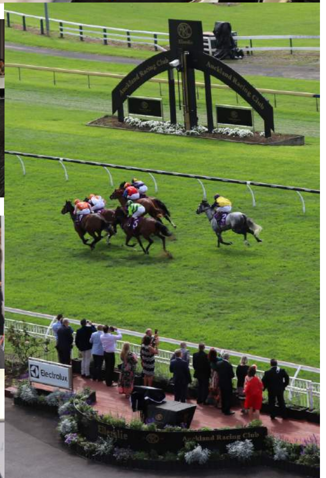
One of our corporate groups watching from the 'birdcage'. The track-side experience was our gift to our generous race sponsors. There's something so special about being up close to the action.