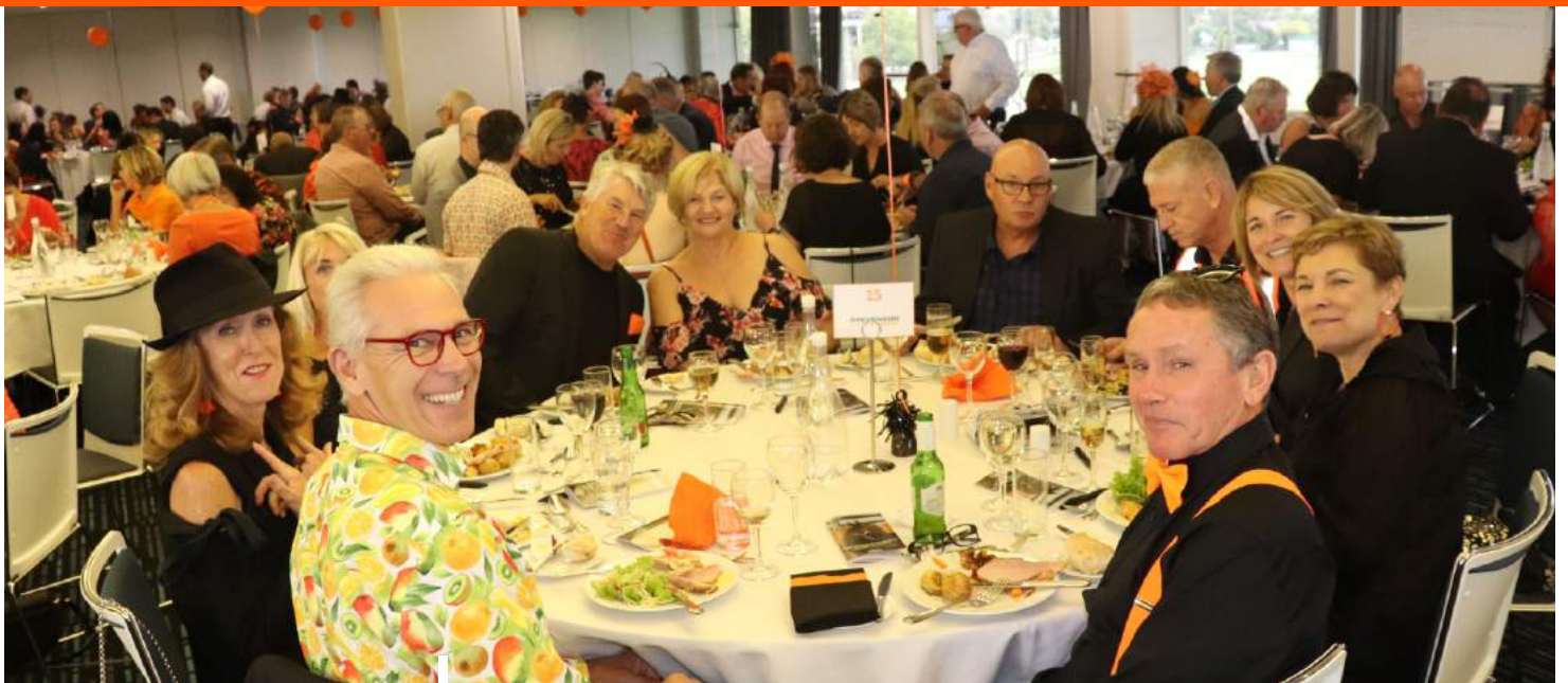
Our 300 guests created a colourful spectacle and a lovely atmosphere.