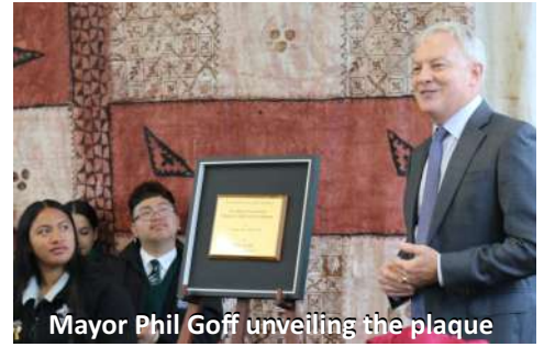
Mayor Phil Goff unveiling the plaque