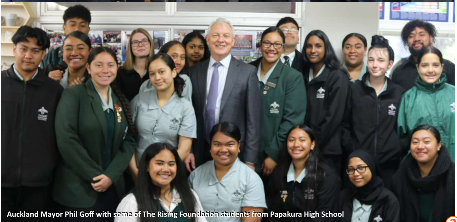
Auckland Mayor Phil Goff with some of The Rising Foundation students from Papakura High School