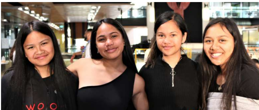
Above: Some of our committed junior students who turned out to support the Graduates. Below: Some of our faithful supporters representing our families and partner schools.