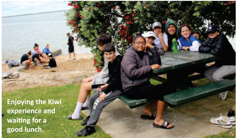
Enjoying the Kiwi experience and waiting for a good lunch.

Overall Rosehill's first ever transition camp for Year 8's went well and it was awesome to witness the growth of all the students who attended. I am looking forward to the New Year and working with these new 'seedlings' and challenging them to grow even more!