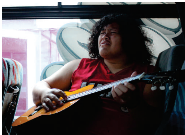
A good programme to learn from and good people to look up to, makes all the difference in young peoples' lives.