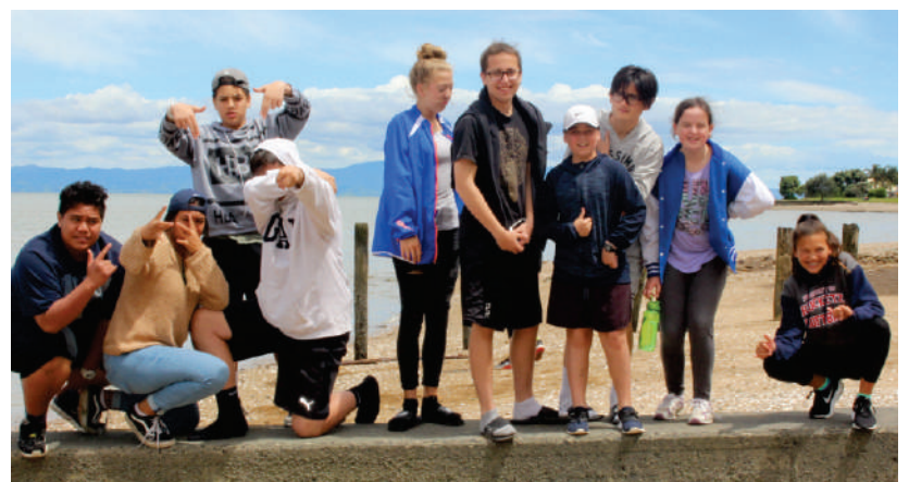
Building strong bonds of friendship and trust across the age range forms the core of our programme. The juniors follow the seniors.